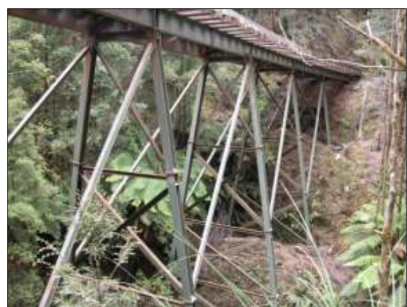
Figure 10 Steel trestle bridge c2001 (Cooper)

The steel trestle design allowed for prior assembly of differing bridge trestle heights with measurements taken for each bridge pier and the individual units transported to the site ready for placement on the prepared concrete footings.